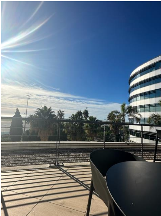
View from 2nd floor terrace at EDHEC