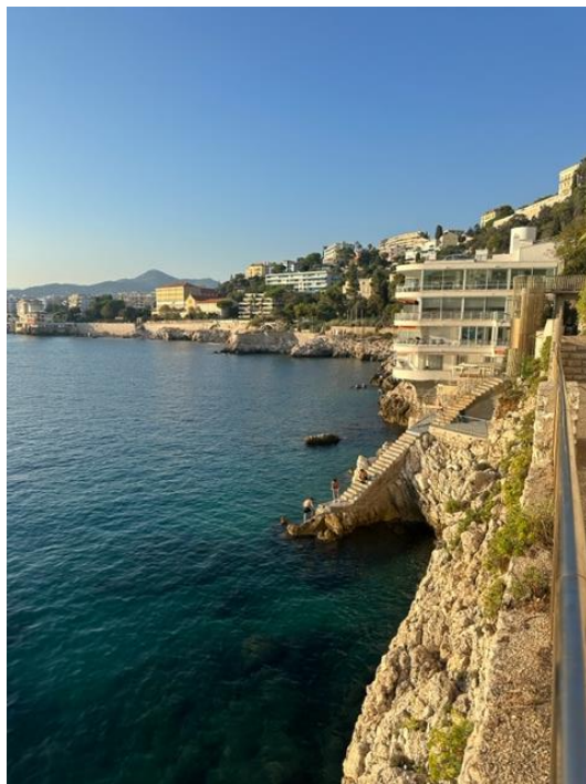
View from Coco Beach, Nice