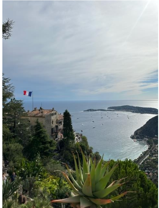
View from Jardin Exotique in Èze